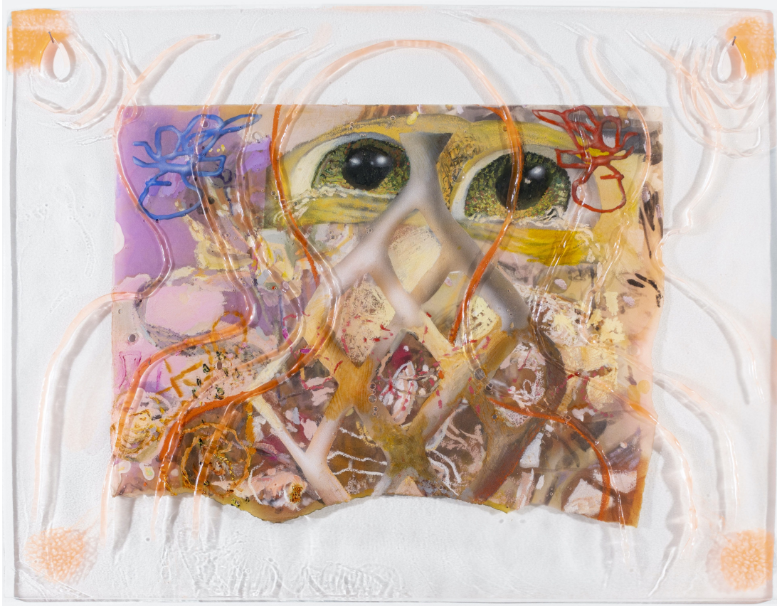
Out There , 2021, painting on paper encased in dyed, low-relief cast epoxy, 24" x 31". $6,000