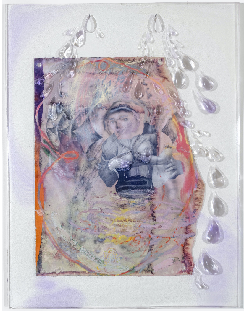
Hard Toy, Cuddly Toy , 2021, painting on paper encased in dyed, low-relief cast epoxy, 31" x 24". $6,000