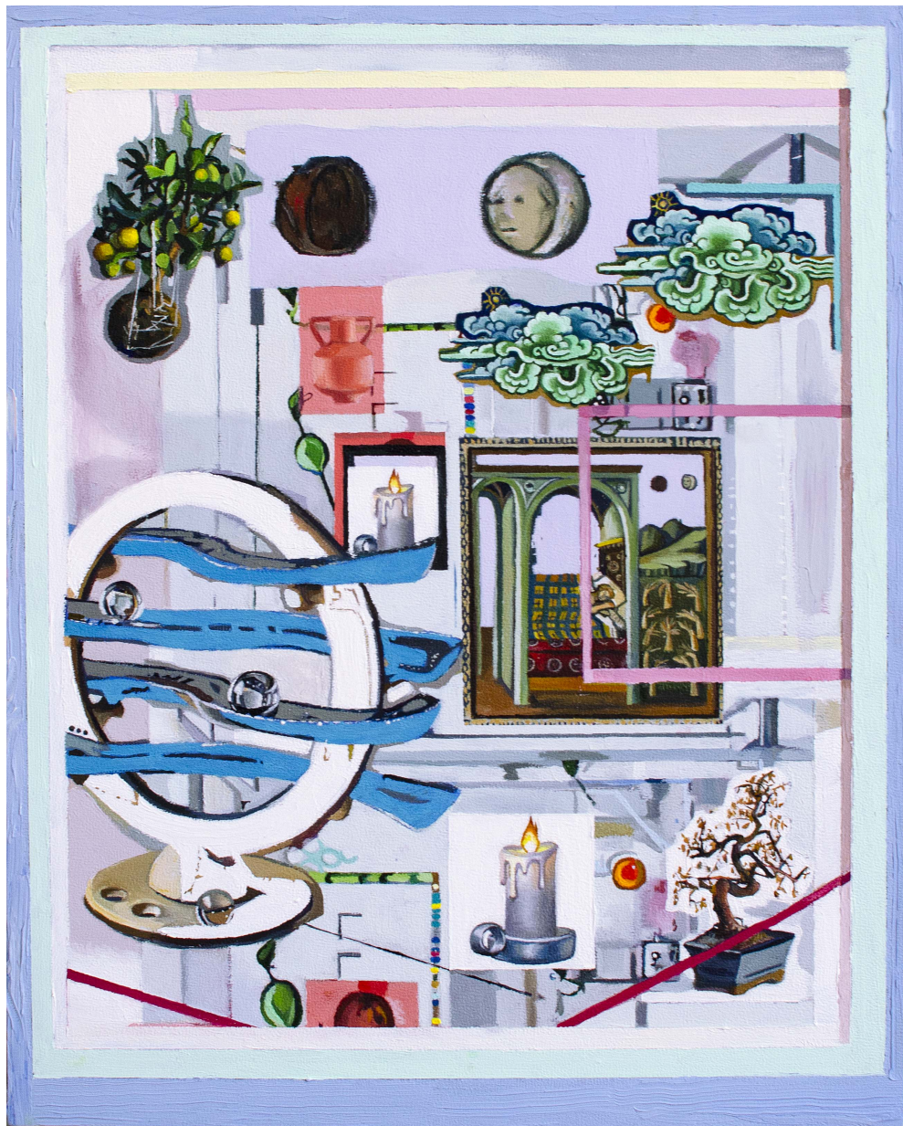
infinity tableau I , 2021, oil on panel, 14" x 11". $375