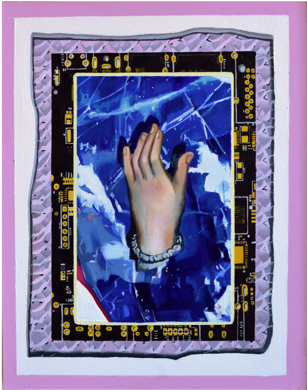
sodalite , 2020, oil on panel, 14" x 11". $325